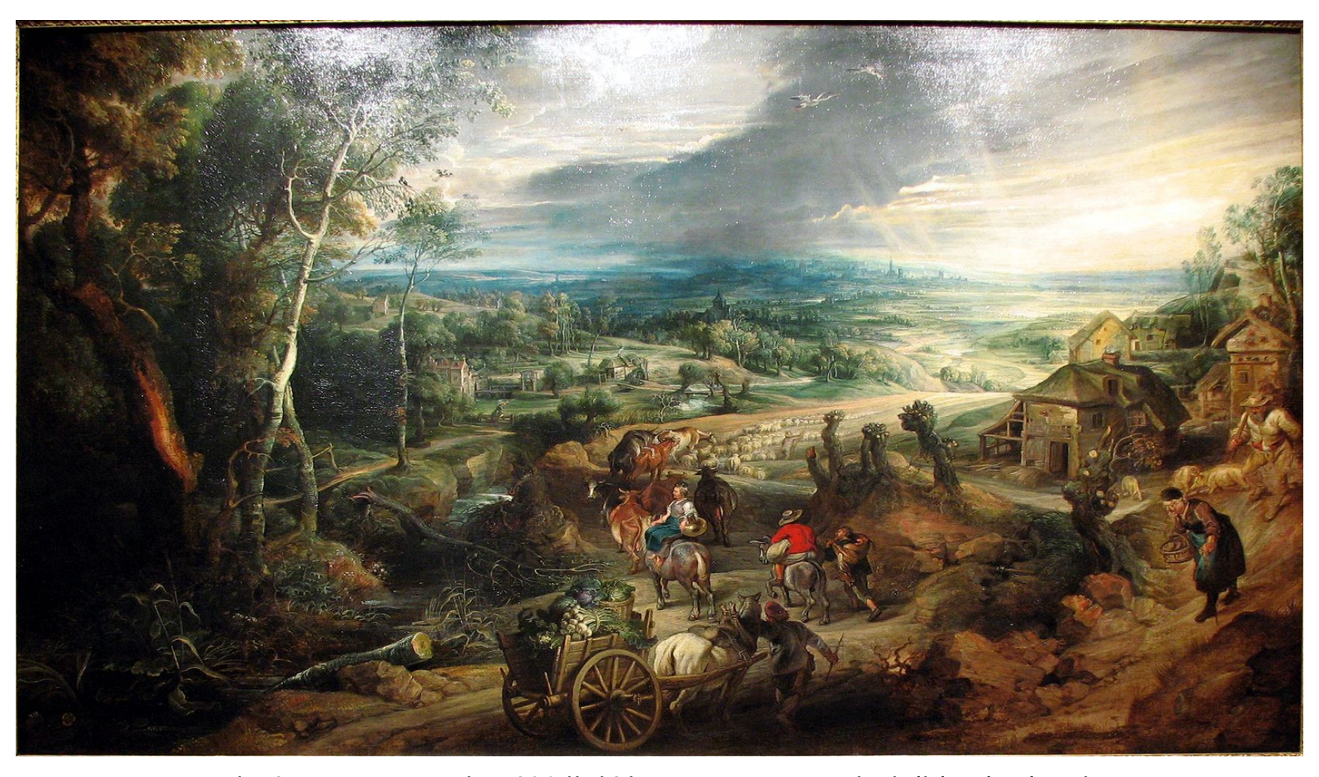
Rubens, Summer, Peasants going to Market, c. 1618. AmblesideOnline.org grants permission to print and use this file for not-for-profit use only.