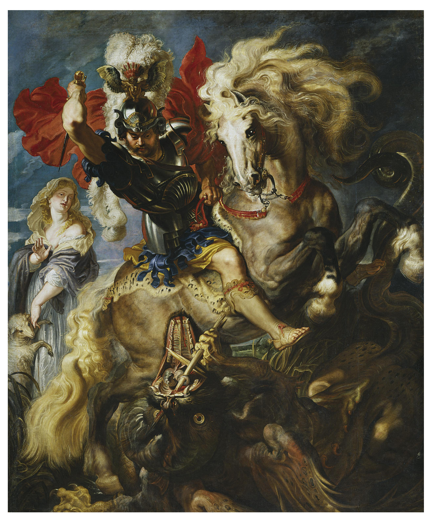
Rubens, St. George and the Dragon, 1606-07. AmblesideOnline.org grants permission to print and use this file for not-for-profit use only.