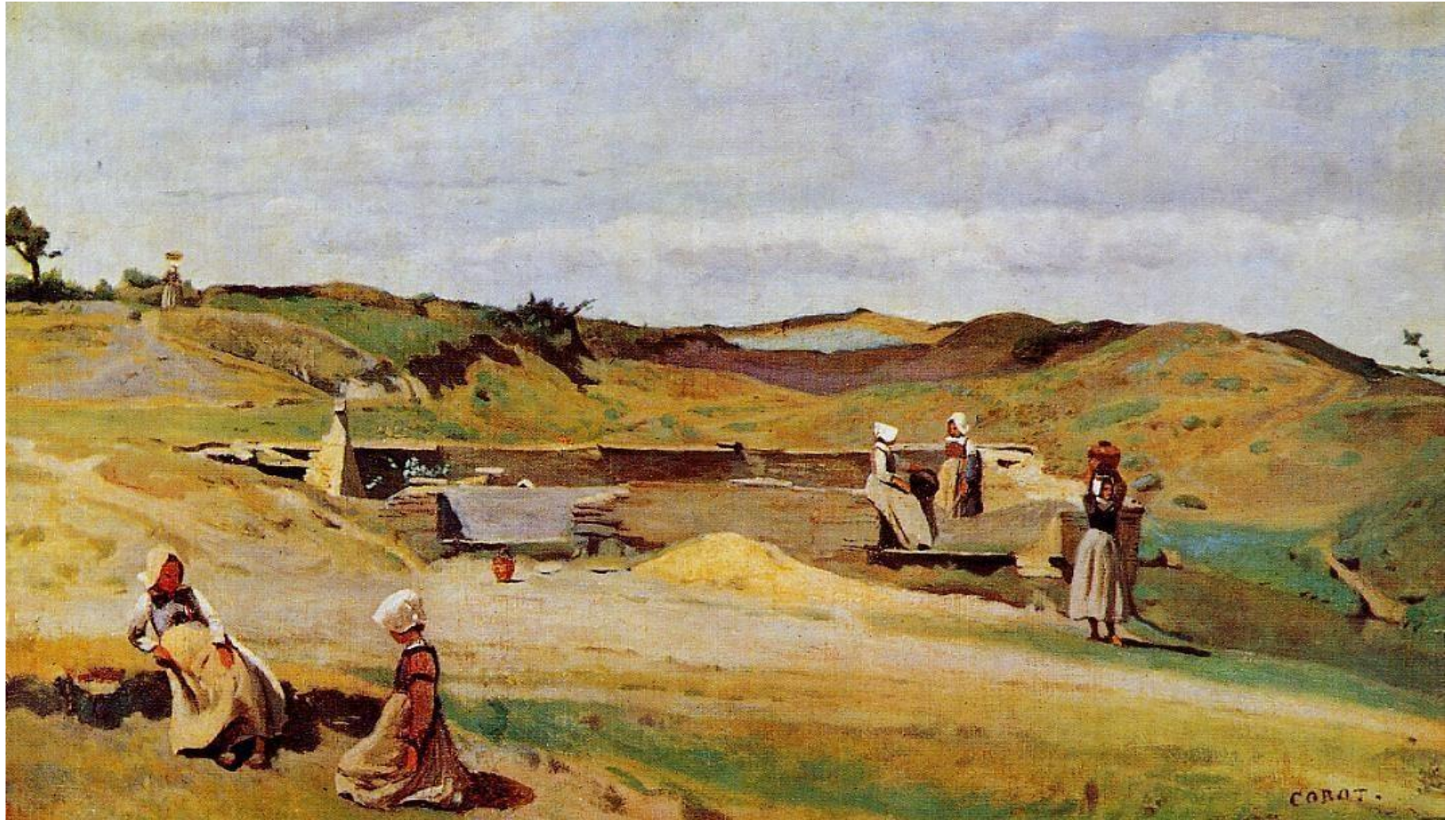
Mur (Cotes du Nord) by Jean-Baptiste Camille Corot 1855 Private Collection