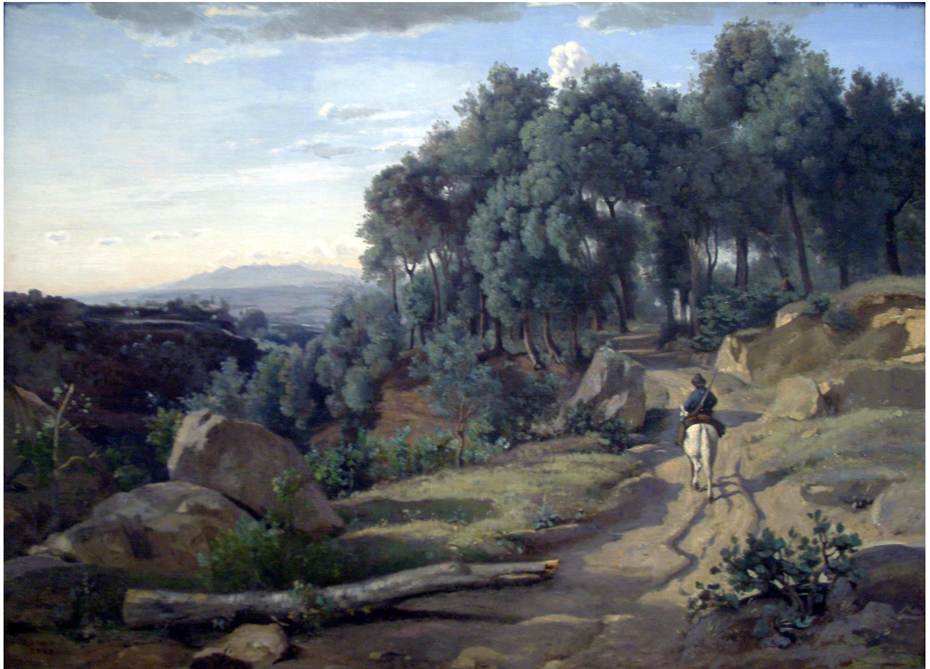
A View Near Volterra by Jean-Baptiste Camille Corot 1838 National Gallery of Art, Washington, D.C.