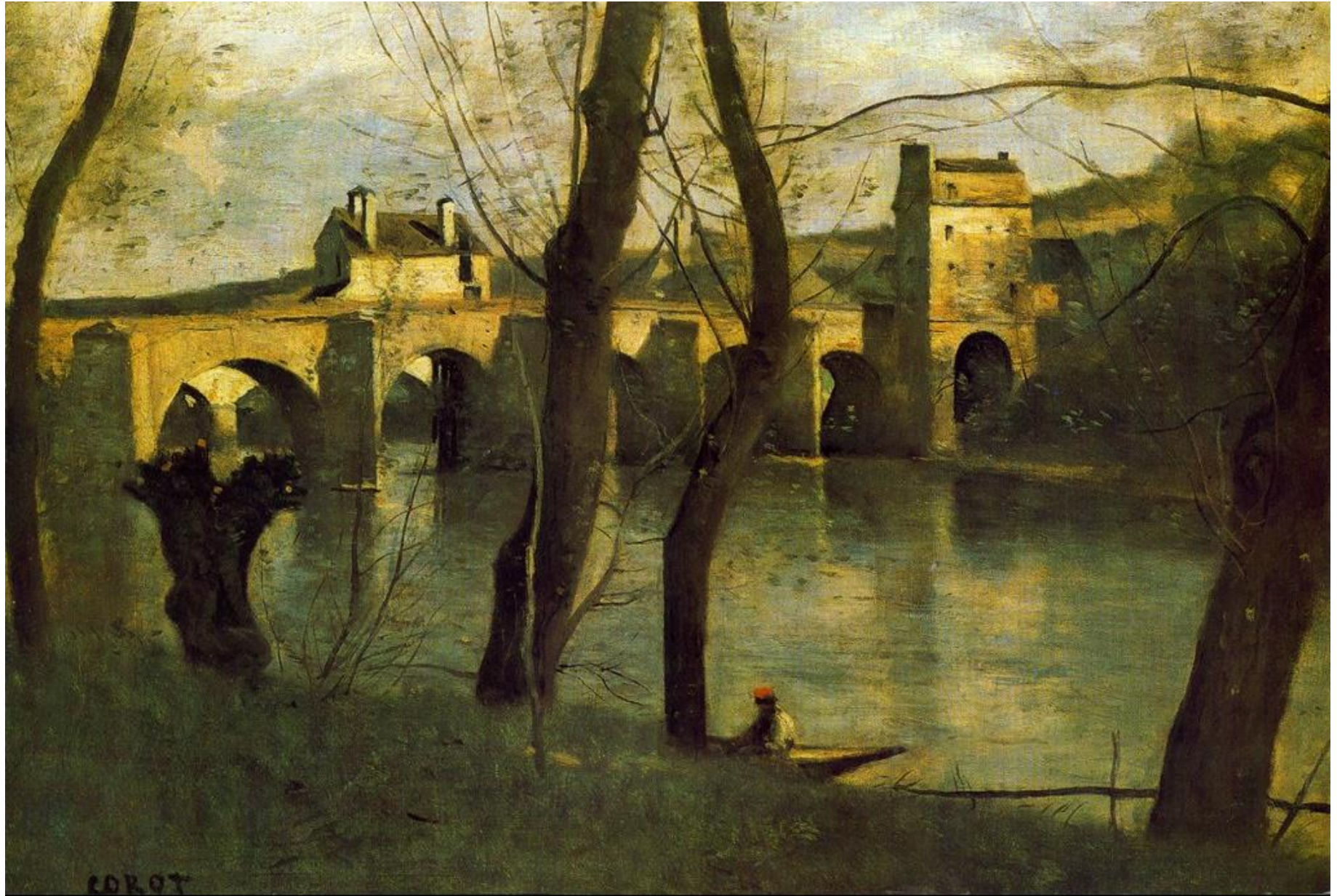
The Bridge at Nantes by Jean-Baptiste Camille Corot 1827 Musée du Louvre, Paris, France