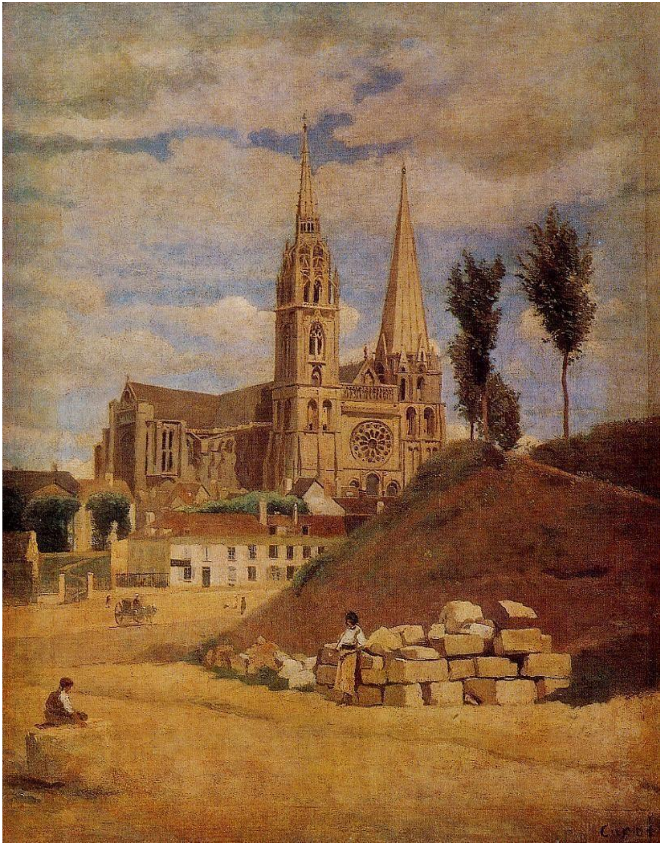
Chartres Cathedral by Jean-Baptiste Camille Corot 1830 (retouched 1872) Musée du Louvre, Paris, France